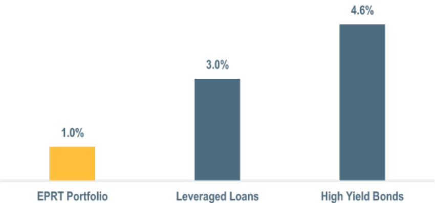
Annual Default Rate Comparison