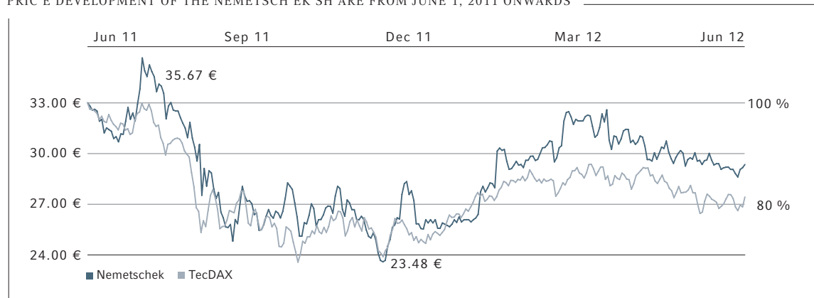
PRICE DEVELOPMENT OF THE NEMETSCH EK SHARE FROM JUNE 1, 2011 ONWARDS

Nemetschek share develops better than the TecDAX