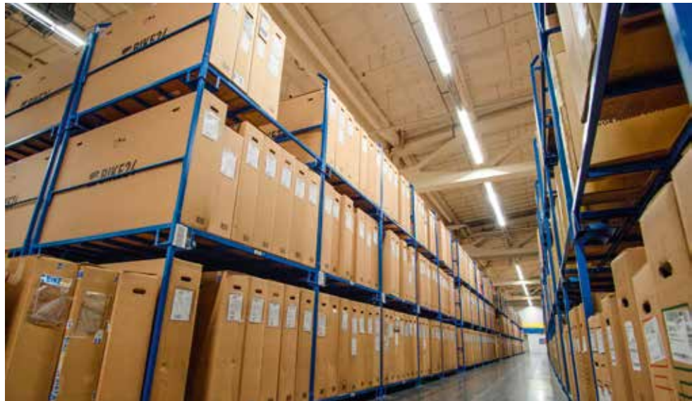
Logistics Center Dresden