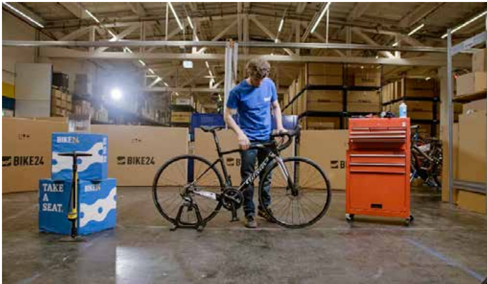
Full-bike assembly hall