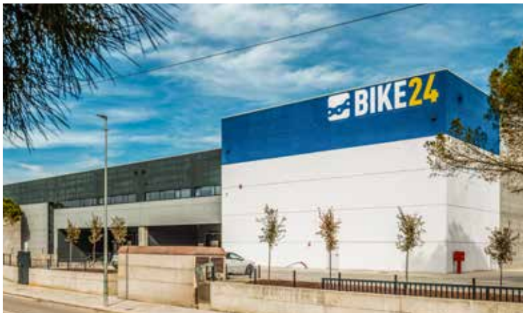
Logistics center Barcelona

Our goal is to become the one-stop shop for everything around cycling in all major European cycling countries. That's why we also rolled out our successful playbook to France and Italy in 2022. In early 2023, our localized online stores were also launched in the Netherlands, Belgium, and Luxembourg.