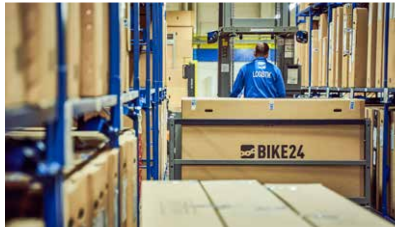
Logistics center Dresden